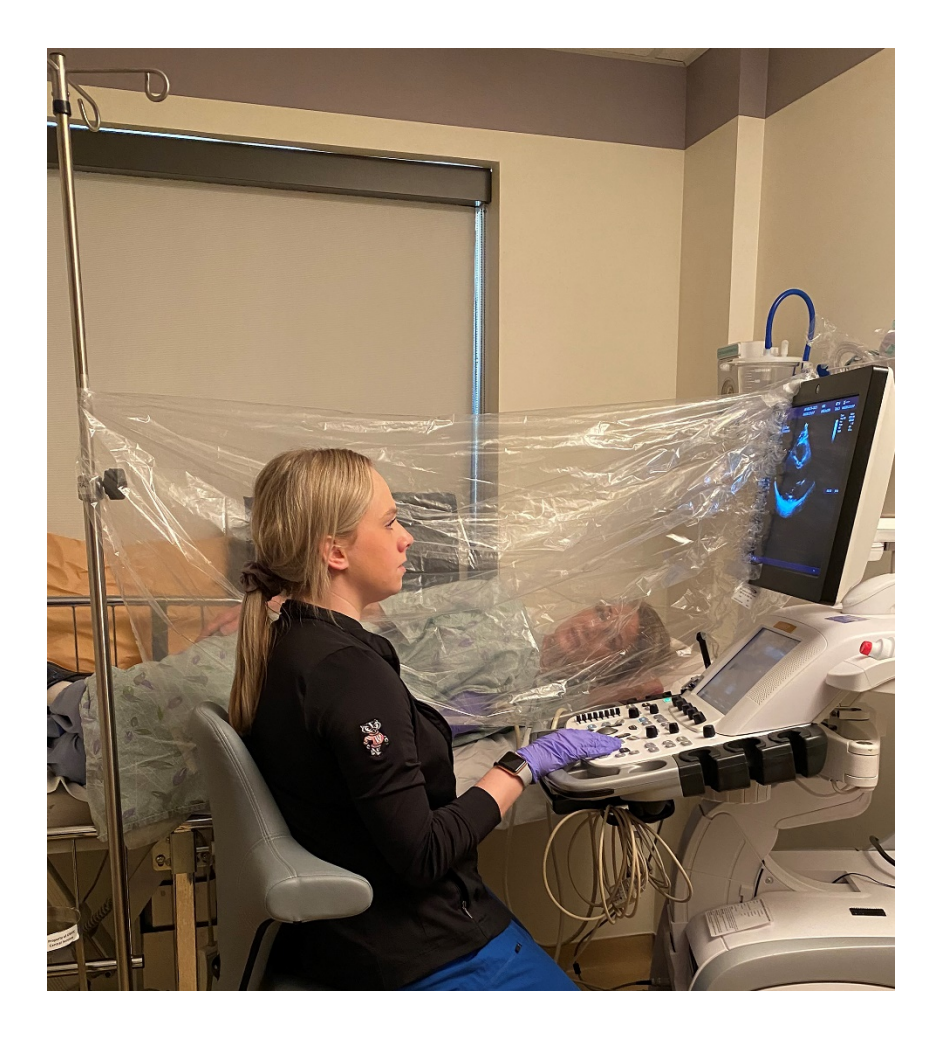
Figure 2. Barrier example used between the patient and the sonographer. <sup>15-17</sup> This is a posed photograph demonstrating the barrier technique and how the sonographer arm can maneuver under the barrier shield. If this were a real situation the sonographer would be wearing appropriate personal protective equipment.

Prior to entry into a room to scan a suspected and/or confirmed COVID-19 patient, all ancillary equipment (extra transducer, EKG leads, linens, etc.) should be removed from the ultrasound system to limit exposure of additional equipment. Sonographers should explore if the patient is already hooked up to an ECG system that could be imported into the echocardiography machine, versus taking the ultrasound system cable and ECG leads. This reduces the need for cleaning ECG cables and leads, which may be difficult to disinfect. If available, the use of a barrier between the bed (where the patient is lying) and sonographer could be set up prior to imaging (see Figure 2).